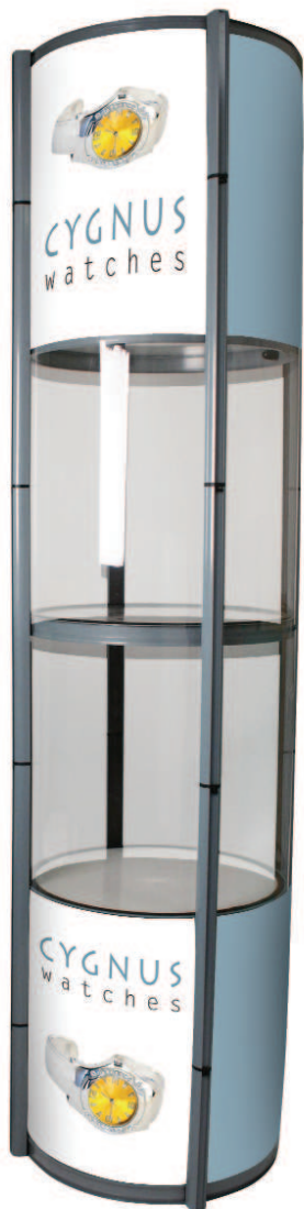
Spiral Tower (NB Graphics are not supplied)

Portable collapsible display cases that assemble in seconds without the need for tools.