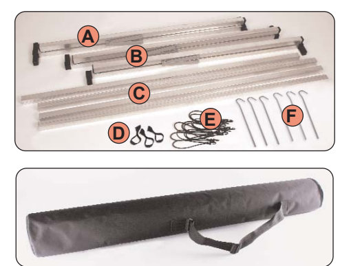
Optional carry bag